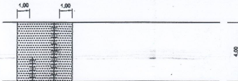
figura 4 doppio scavo trasversale alla carreggiata